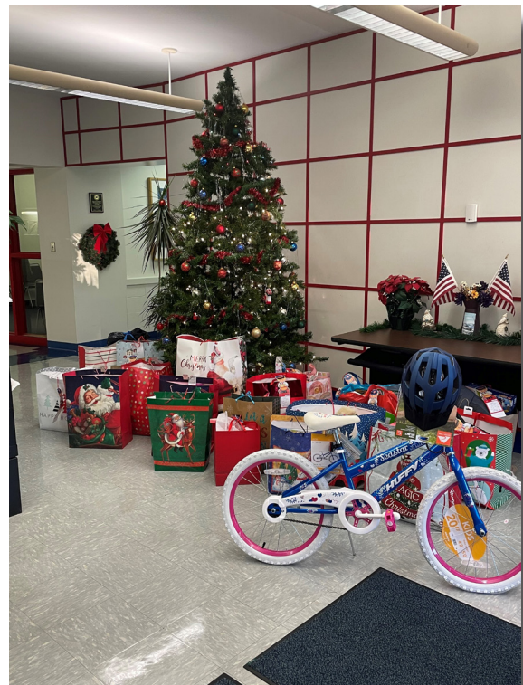
The teams from District 2 Engineering/Construction and Highway Operations joined forces to take part in the Salvation Army's Angel Tree initiative this year. Because of their incredible generosity, District 2 was able to fulfill the Christmas wishes of 25 children.