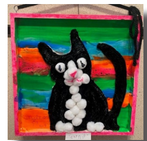
“Catnip” by Myles Parent