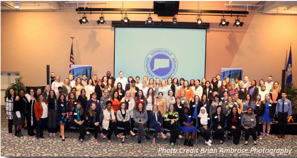
CTDOT team at WTS Mini Series on October 17, 2023

On October 17, the Connecticut Department of Transportation (CTDOT) made its presence felt at the annual WTS Transportation Mini-Series hosted by Central Connecticut State University. This event drew nearly 90 CTDOT staff members from various departments, all eager to engage in informative discussions. The morning's plenary session kicked off the event as we heard from women leaders in Connecticut at the federal, state, municipal