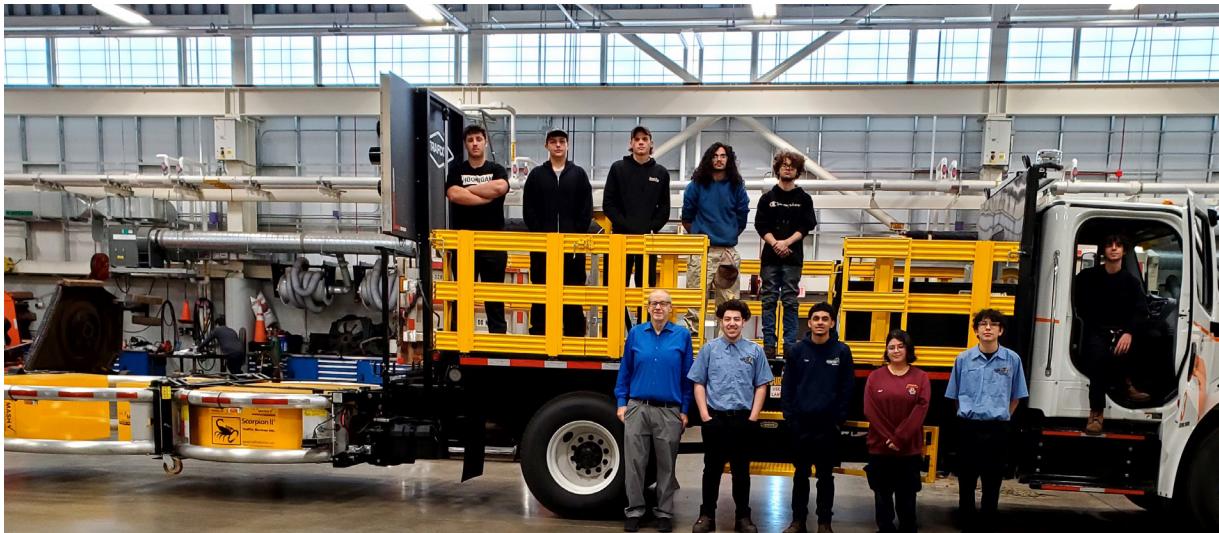
CTDOT's first group of High School Cooperative Education Interns

CTDOT is excited to announce that our first group of High School Cooperative Education interns are currently working in the Bureau of Highway Operation . These positions are assigned to assist in critical areas of repair and machine shop functions, as part of the CTDOT's workforce development initiative, targeting and employing, junior and senior high school students with educational enrollment in hard to recruit for trades areas. CTDOT Human Resources and Bureau of Highway Operations staff worked with the Connecticut Technical Education and Career System (CTEC) High Schools, the Department of Administrative services, the Depart-