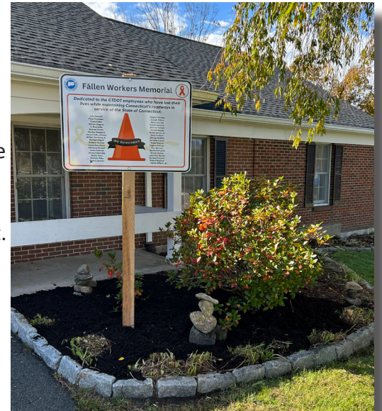
Danbury Rest Stop