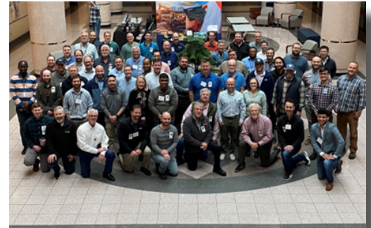
Team CTDOT at Every Day Counts

Representatives from units across our department also attended, including AEC Applications, Bridge Design, Highway Design, Traffic Engineering, Illumination, Survey, Construction Operations, District Construction, Planning, GIS and Asset Management. The conference brought over 90 attendees together to gain a common understanding of Building Information Modeling (BIM) infrastructure and innovative processes of digital delivery. BIM for infrastructure is a collaborative work method for structuring, managing, and using an agency's enterprise-wide data and information for transportation assets throughout